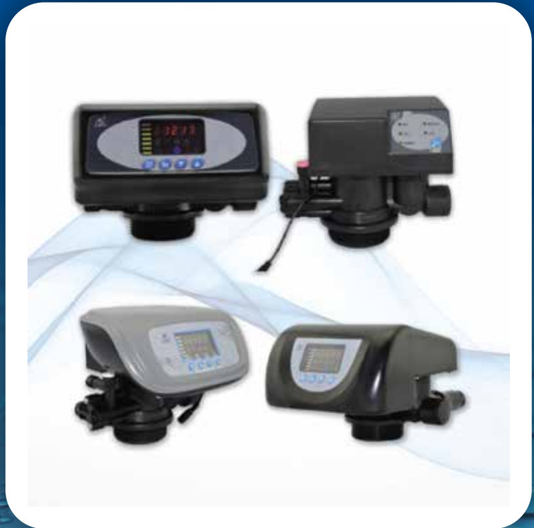
Automatic Softener Valve