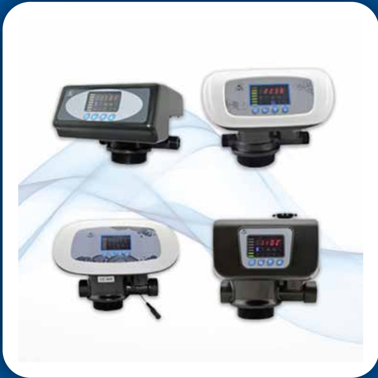
Automatic Filter Valve